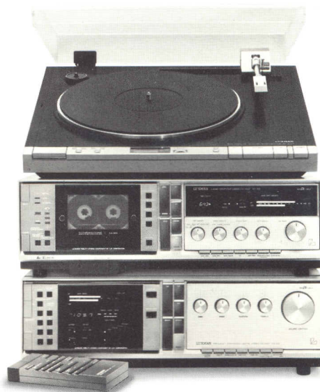
An ideal system in combination with the PX-101 is the Luxman RX-103 Receiver with Remote Control and the KX-102 Computer Cassette Deck.

Pitch Control: The speed can be adjusted by turning pitch control up to ±3.0%.